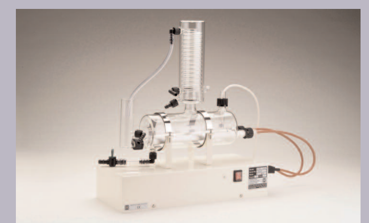
WSE/4S Fitted with silica heater

Hamilton economy water stills provide the same performance as four litre cabinet stills. The still features a high quality boiler and condenser distillation unit mounted on a stove enamelled metal chassis with all electrics in a metal housing.