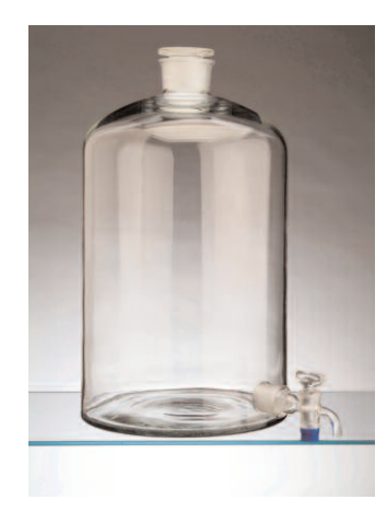
20 litre aspirator bottle can be supplied as a bench-mounted alternative reservoir to the cabinet style reservoir.

All cabinet water stills can be supplied as a complete unit mounted on Hamilton 25 litre reservoirs. Add prefix RS/25 to catalogue number. If required, customers can fit reservoirs to existing stills but they must be returned to our factory for fitting. Aquamatic stills can be used with any type of reservoir and do not have to be returned to our factory.