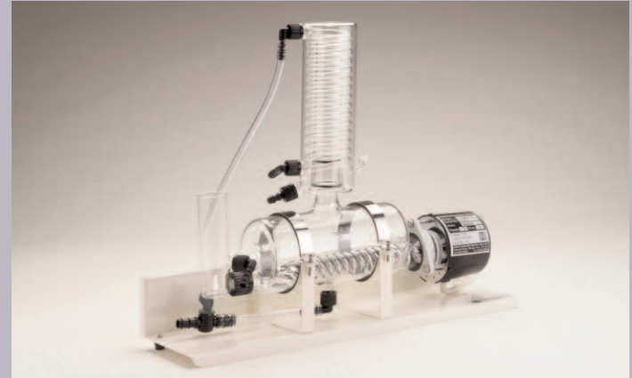
WSB/4 Fitted with metal heater

Hamilton budget water stills have been produced mainly to meet educational requirements. The still is a basic low cost unit, with an easy drain facility. Mounted on a stove enamelled metal chassis it will give four litres per hour of distillate but still retains safety thermostatic cut-out and high quality glassware.